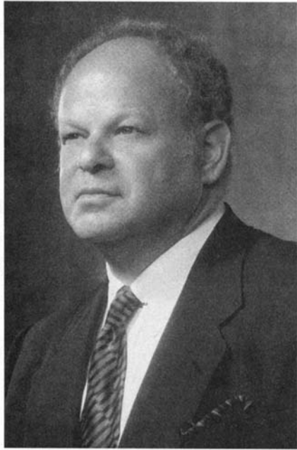
Martin E. P. Seligman